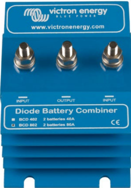
Argo Diode Battery Combiner BCD 802

Diode Battery Combiners are used to guarantee continuous DC power to mission critical equipment, such as an electronic engine control system. With a diode battery combiner two or more DC power sources can be used in parallel to supply the mission critical load. Failure of one source will not interrupt power to the critical load.